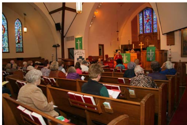
Voting members worked diligently during the business session electing new Board Members and passing two resolutions;