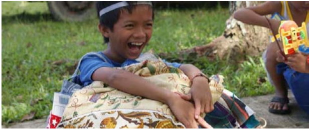
Materials copied from LWR web-site ... used with permission

Lutheran World Relief writes ... “When you make and send a quilt, you are not only comforting someone you have never met, but providing an object that is useful in ways you probably never imagined.