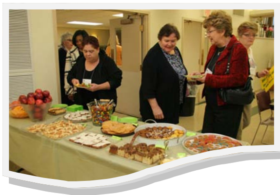
Lots of yummy goodies were waiting for us when we arrived on Saturday, October 11th.