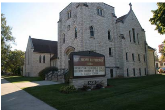
Mt. Hope Lutheran Church on the corner of 86th & Becher in West Allis was the site of our 27th Annual Convention.