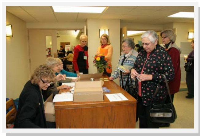
The women working the registration desk were kept busy as they welcomed convention guests.