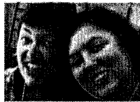
Meet Old Friends, Make New Friends

SHOP OUR FAIR TRADE BOUTIQUE & ENJOY CERTIFIED MASSAGE THERAPISTS