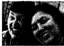
Meet Old Friends, Make New Friends

SHOP OUR FAIR TRADE BOUTIQUE & ENJOY CERTIFIED MASSAGE THERAPISTS